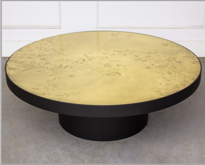
Shown in Ginkgo pattern etch and matte black steel base